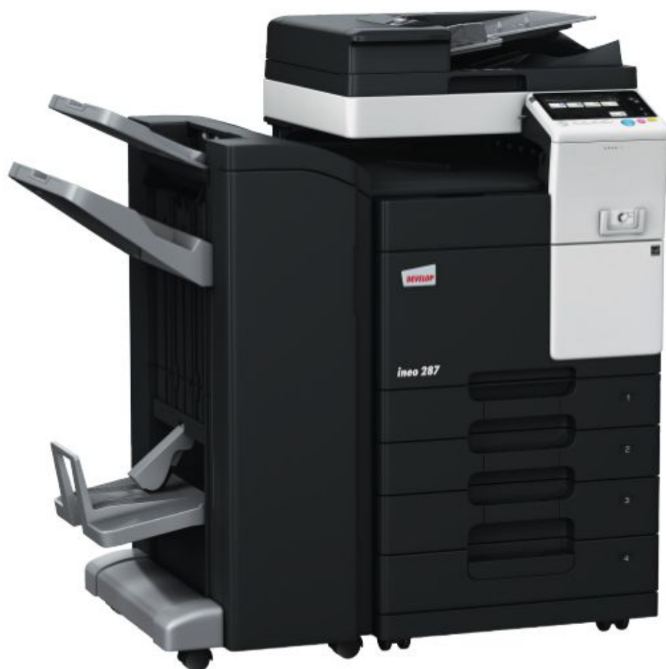
ineo 287 with document feeder (DF-628), staple/booklet finisher (FS-534SD), paper feeder (PC-213) and mount kit for local ID card authentication device (MK-735)

The monochrome devices features a variety of energy-saving functions that cut power consumption. Besides saving you money, these green features are also good for the environment – and your carbon footprint.