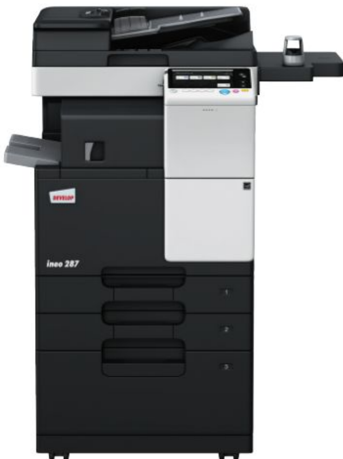
ineo 287 with document feeder (DF-628), inner finisher (FS-533), paper feeder (PC-413) and biometric authentication kit (AU-102)

Job centres, schools and universities, engineering firms, architect's offices, insurance companies, banks, libraries: many small to mid-sized businesses or organisations don't really need colour printing capabilities. What their users really require is a monochrome multifunctional device that is intuitively easy to use and offers simple mobile usability for the increasing number of mobile office workers.